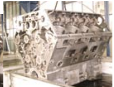
Picture above US Navy Engine Rebuild Facility Southwest Regional Maintenance Center - San Diego Before & After Immersion in Evapo-Rust.